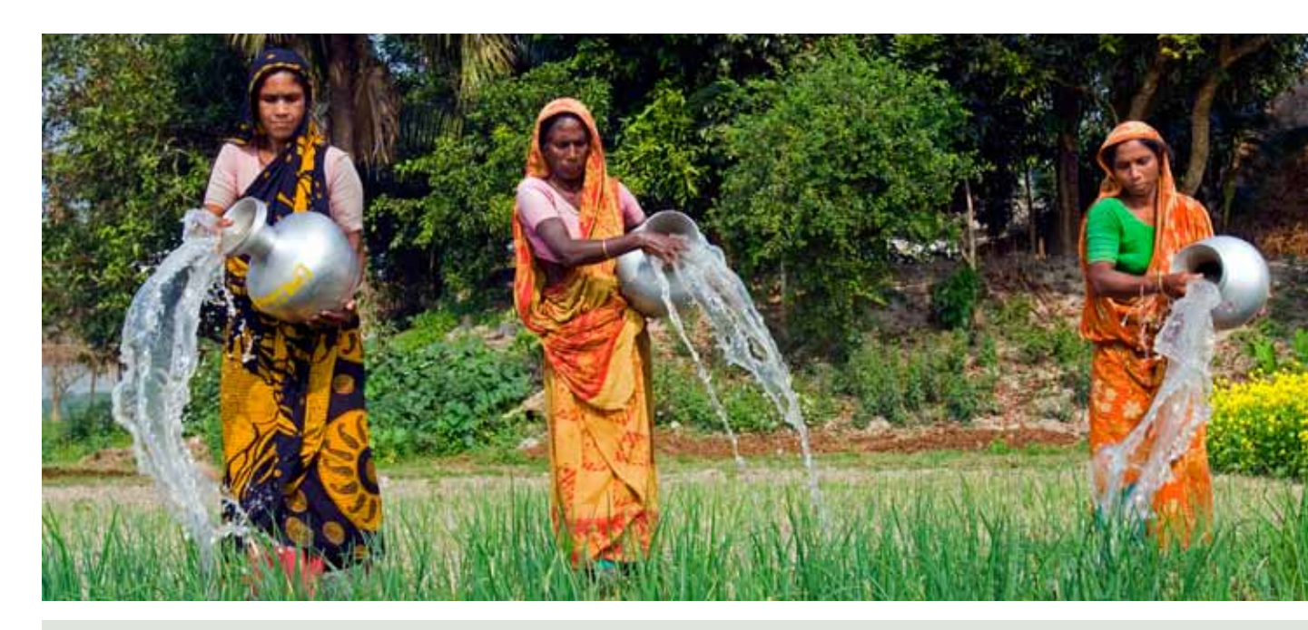
Farmers irritigating a field in Bangladesh.