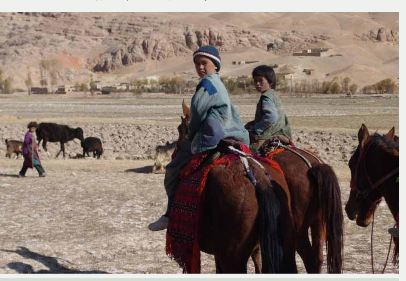
Caption: Young herders in Yakawlang Valley, Bamyan Province Afghanistan.