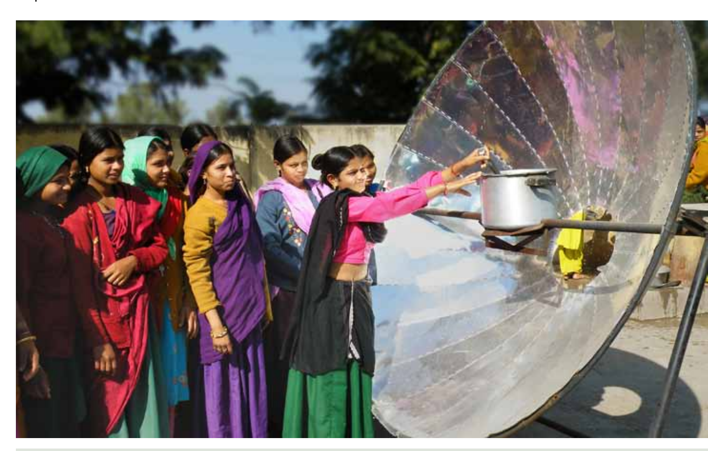
A group of young women in India learn how use a solar dish for cooking.

The list in Box 5 is expanded in Annex A, Tool #2, which shows sub-topics (or "sub-capacities") for each of the seventeen key capacities. The expanded list is intended to highlight the spectrum of the capacities that a society needs to achieve its environmental sustainability goals. Tool #2 can be used at various steps in capacity development, as suggested in the introduction to the tool. For example, it can be used as a checklist to identify capacity assets and needs and/or to choose priorities for capacity development. A particular initiative will likely focus on one more of the capacities and sub-capacities, depending on its purpose and scope.