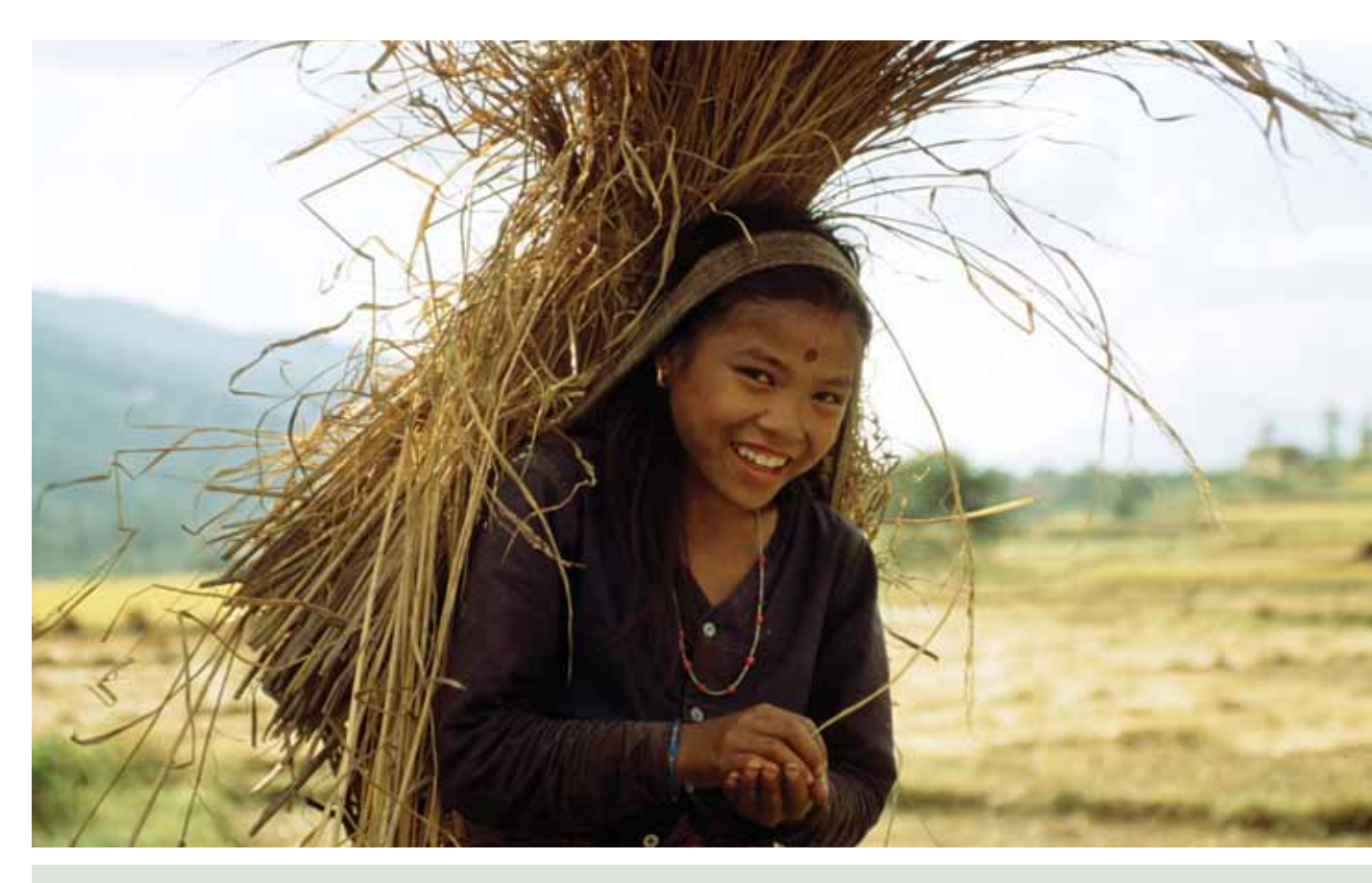
Young woman carrying sheaf of rice Nepal, Kathmandu Valley, Sankhu village.

UNDP's analytical framework for CDES recognises three levels of capacity – the individual, the organisation and the enabling environment (or "system level"), which includes the political, social, economic, policy, legal and regulatory systems within which organisations and individuals operate. The framework also identifies key capacities that can be strengthened in order to achieve specific environmental sustainability goals. These include functional capacities needed to undertake the core functions involved in implementing CDES initiatives, including capacities to: